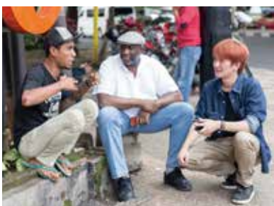
African and Asian Culture