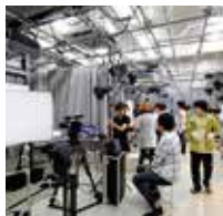
Stop Motion Animation Studio