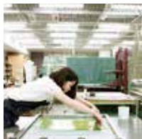
Silk-screen Printing Studio