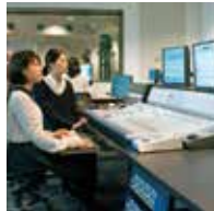
Audio Effects Studio